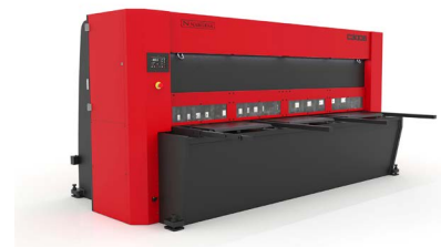
HYDRAULIC SHEAR MACHINES