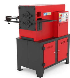
END WROUGHT IRON MACHINES