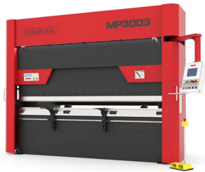
HYDRAULIC PRESS BRAKES