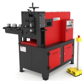
IRON EMBOSSING MACHINES