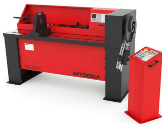
TWISTING/SCROLL BENDING MACHINES