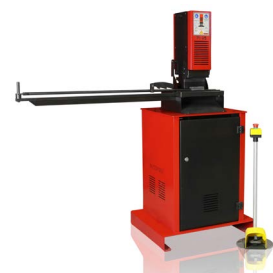
PRESSES FOR LOCKS