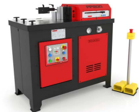
HORIZONTAL PRESS BRAKES