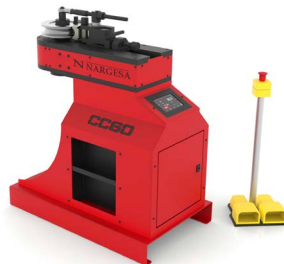
NON-MANDREL PIPE BENDER