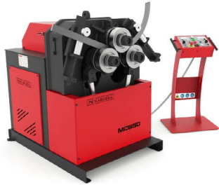
SECTION BENDING MACHINES